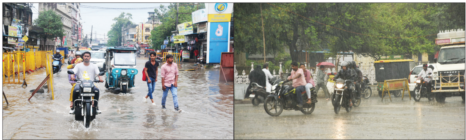
Intermittent showers continued in the city on Saturday.